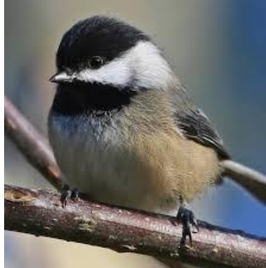
Black Capped Chickadee