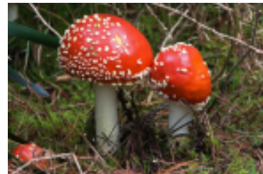
Amanita Red Cap