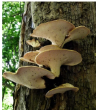
Oyster Mushroom- Panellus stipticus