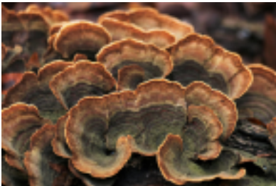
Stereum hirsutum- Cap