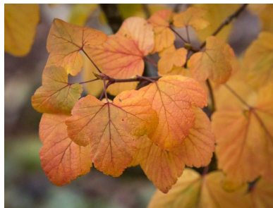
Red Flowering Currant