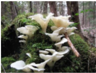
Oyster Mushroom- Pleurocybella porrigens